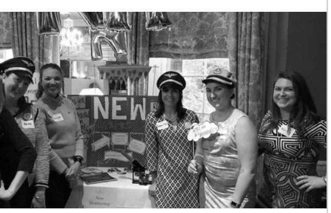
Members of New Membership committee.