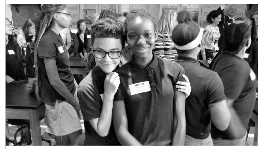
Community Improvement Project's ribbon cutting ceremony at Harbor Science and Arts Charter School May 2017.

The pilot program will begin this winter after the committee develops the modules and trips for Harbor Science & Arts students. To learn more about Harbor Science & Arts Charter School and see the NYJL's science classroom renovation, go to bit.ly/nyjl-harbor.