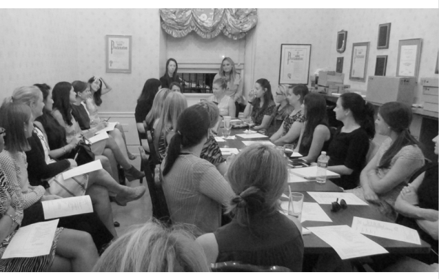
Members of Golden Tree committee.