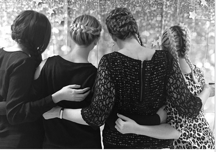
NYJL volunteers connect with survivors of domestic violence at the Love Yourself Party in December 2016.